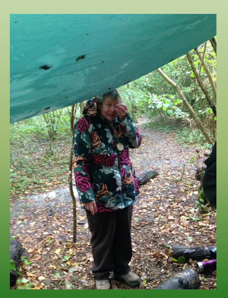
Do you know why it was so smoky?